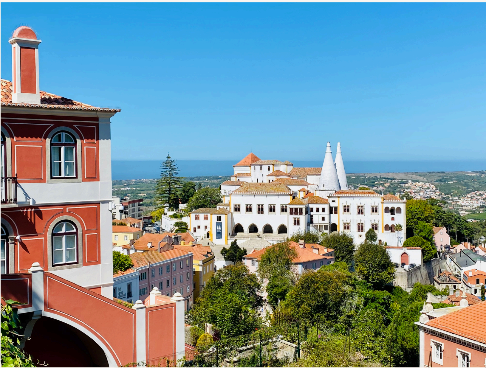
Sintra National Palace